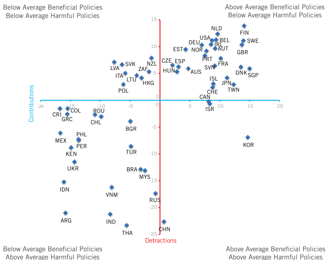
Figure 3: Scatterplot of Countries' Contributions to and Detractions from Global Innovation

Nations' decisions, individually and collectively, on the innovation-based growth strategies they pursue affect the global innovation system; therefore, countries cannot think about growth only from their own narrow perspective.