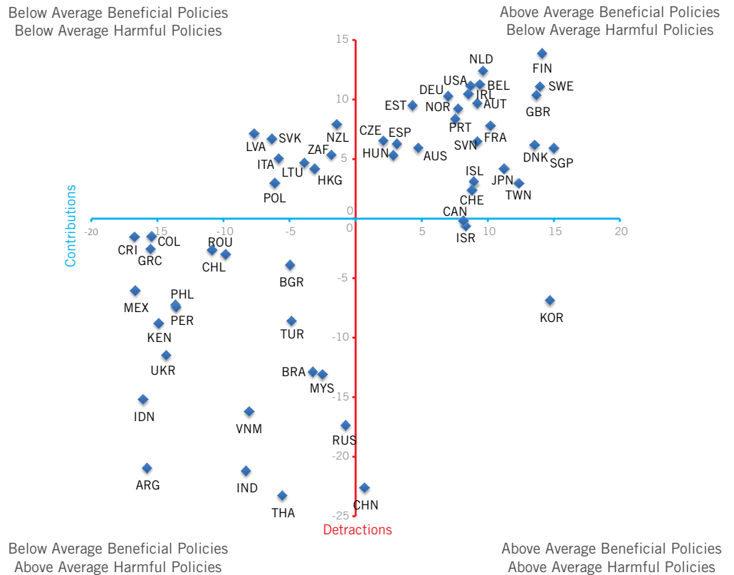
Figure ES-1: Scatterplot of Countries' Contributions to and Detractions from Global Innovation

As the report subsequently elaborates, eight categories of countries emerge from this research: Adam Smithian, Advanced Asian Tiger, European Union (EU) Continentalist, EU Up and Comer, Innovation Follower, Innovation Mercantilist, Schumpeterian, and Traditional Mercantilist. Some of these groups—including the EU Up and Comers and Innovation Followers—contribute relatively little to the global innovation system, but do little to harm it. By contrast, most Advanced Asian Tigers, such as Korea, Japan, and Taiwan, make significant contributions to the global innovation systems (e.g., high levels of investment in scientific research and education) but also enact significant innovation mercantilist policies that detract from it. The Innovation Mercantilists—such as China and Russia—make modest contributions but implement severely dettractive trade, competition, and IP policies.