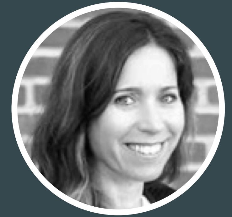
Marta Ortega Valle Director of the Board Strategic Advisor International